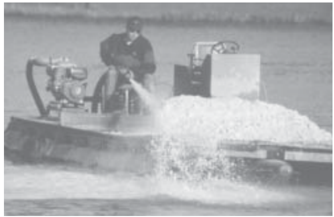
Figure 2. Broadcast agricultural limestone from a barge.

Difficulty of application is the only drawback to the use of agricultural limestone in ponds. Application of 2 tons or more per acre to full ponds requires that the lime be spread from a barge in all but the smallest ponds (Figure 2). Without the aid of heavy machinery, spreading enough limestone to fully neutralize the soils of the pond bottom can be backbreaking work. Many private pond consultants have the proper equipment to lime large ponds for a reasonable fee. For small ponds, less than about 3 acres, the lime can be spread from the shore if the spreader can approach the pond at several points around the shoreline so the lime will contact the entire pond bottom.