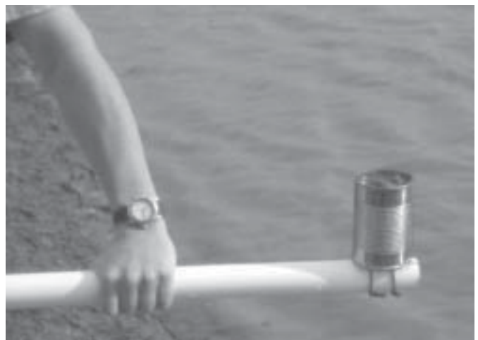
Figure 1. A simple sampler for collecting mud from a full pond