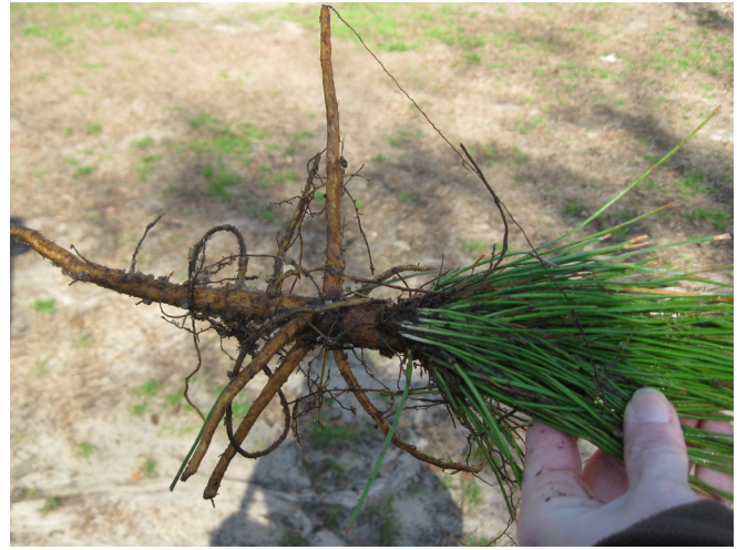
Seedlings may be container grown or bareroot like the longleaf pine seedling shown here.