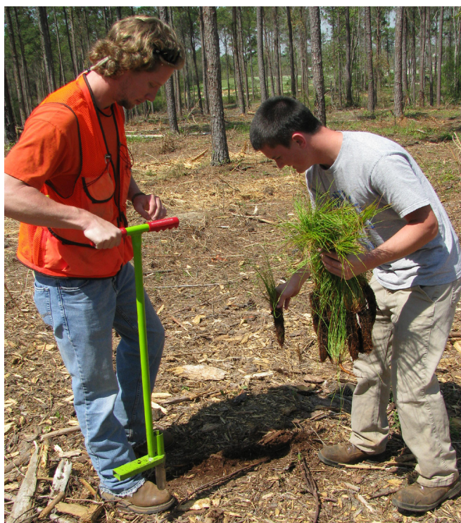
While landowners may enjoy planting small forest patches themselves, hand planting can be a big job that most will not want to do on their own.

To protect your investment, you must ensure that planting is done properly.