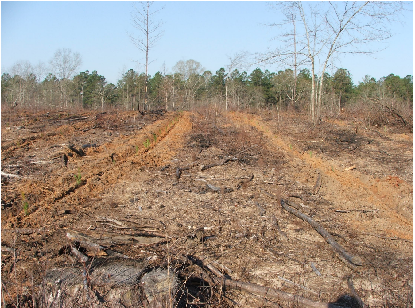
Machine planted forestland.