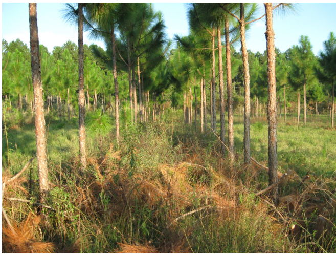
Planted longleaf pine.