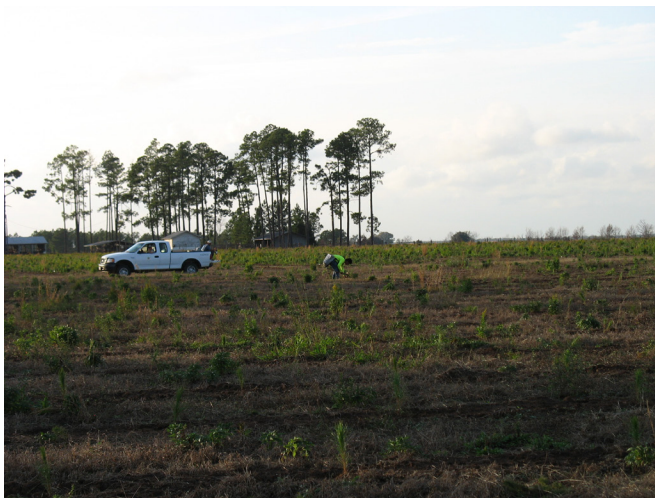
Contractors will provide labor, materials, equipment, and transportation needed to complete a planting job.