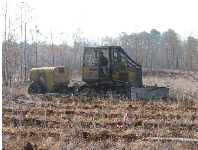
Contractor using a machine tree planter should take care not to allow fuel or oil leaks.

This section of a planting contract primarily introduces all the responsible people who will be involved in the planting operation.