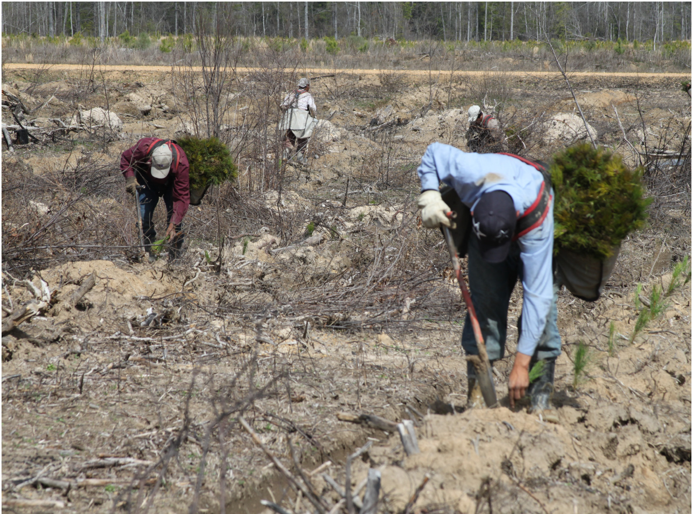
Good and acceptable forestry practices should be followed at all times. Seedlings should be kept in bags until planted.